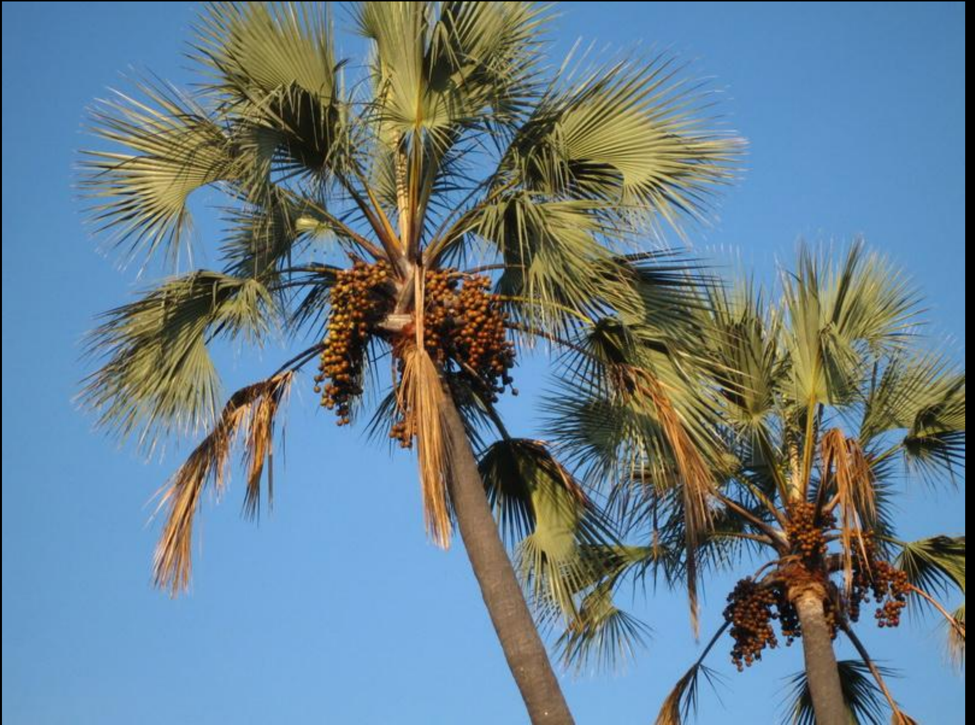
These are palm nuts, not coconuts. They have a hard white interior. I have seen carvings made from these in Coral Gables, Florida. I bought a frog for the Young's from one of these nuts in Florida.