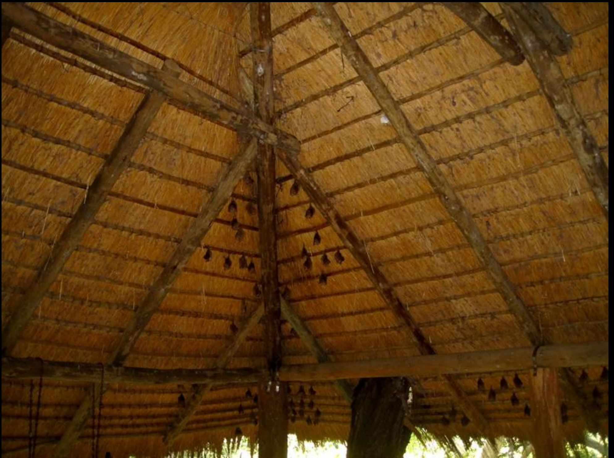
Bats slept during the day in the roof of the main lodge at Sandibe. They didn't move unless the monkeys came and stirred them up.