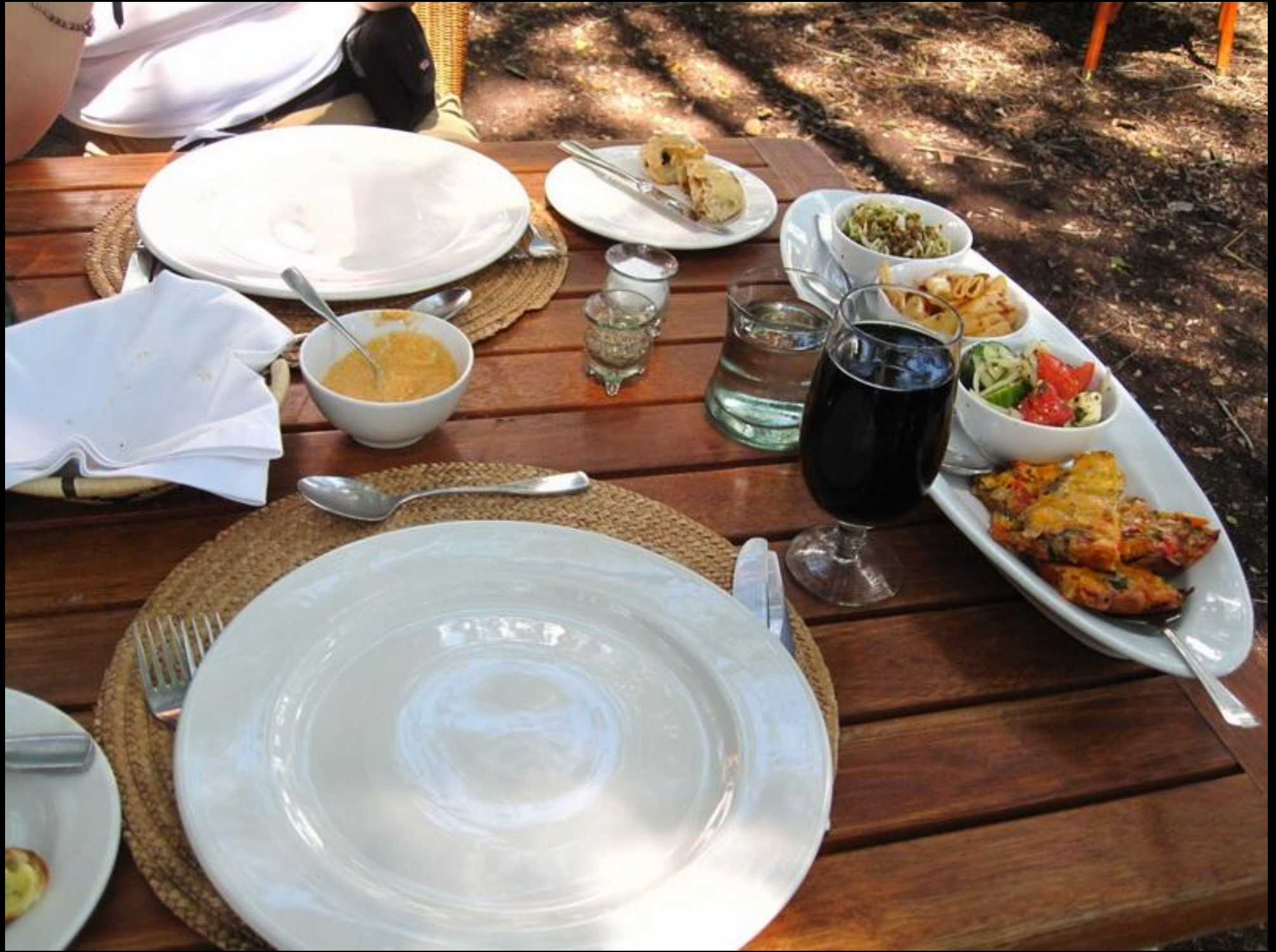
They call this high tea, one of our seven meals a day. This one was at 1600 before we departed on our game ride.