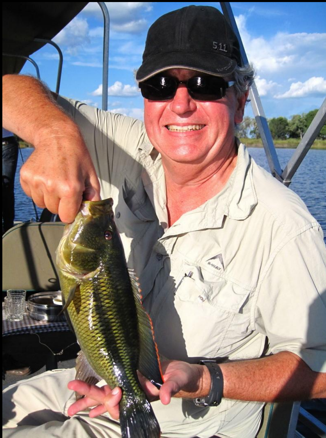
We would catch and release African Brim. I was very lucky and caught the first one.