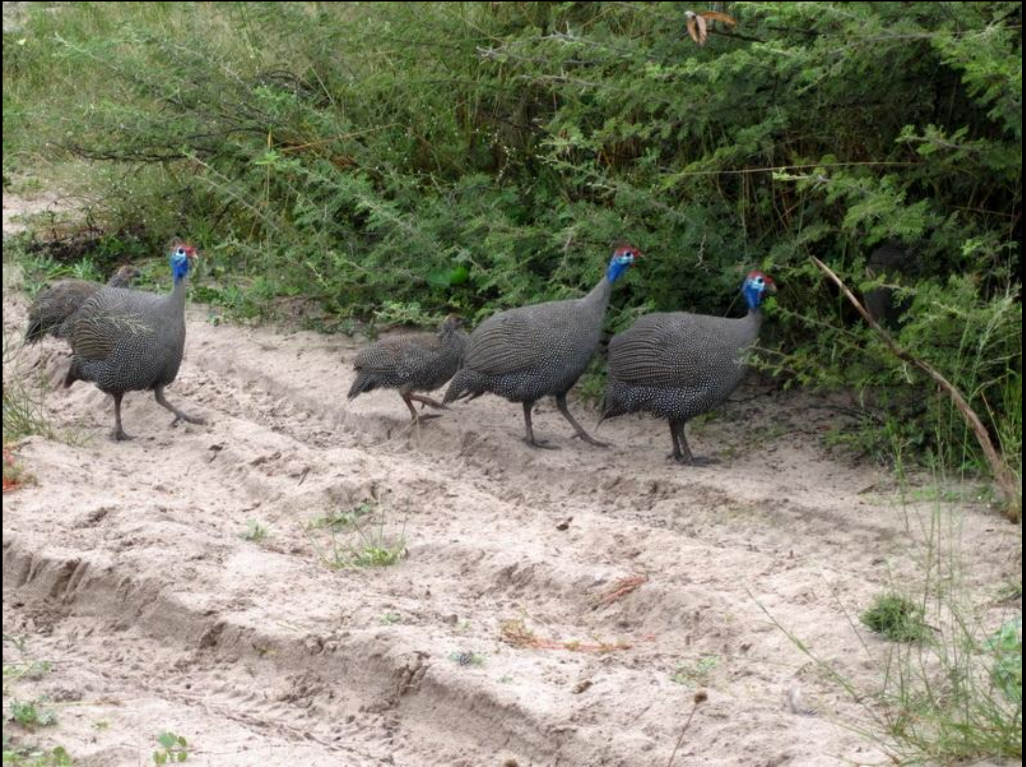
These Helmeted Guineafowl were running around wild. They say they are as tasty as they are beautiful.