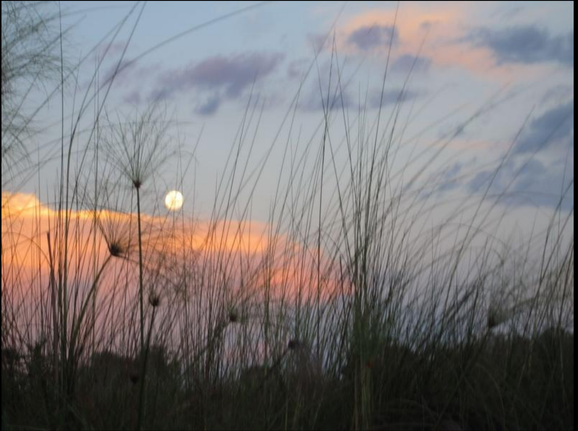
These plants are papyrus, the same plants from which the Egyptians made paper.