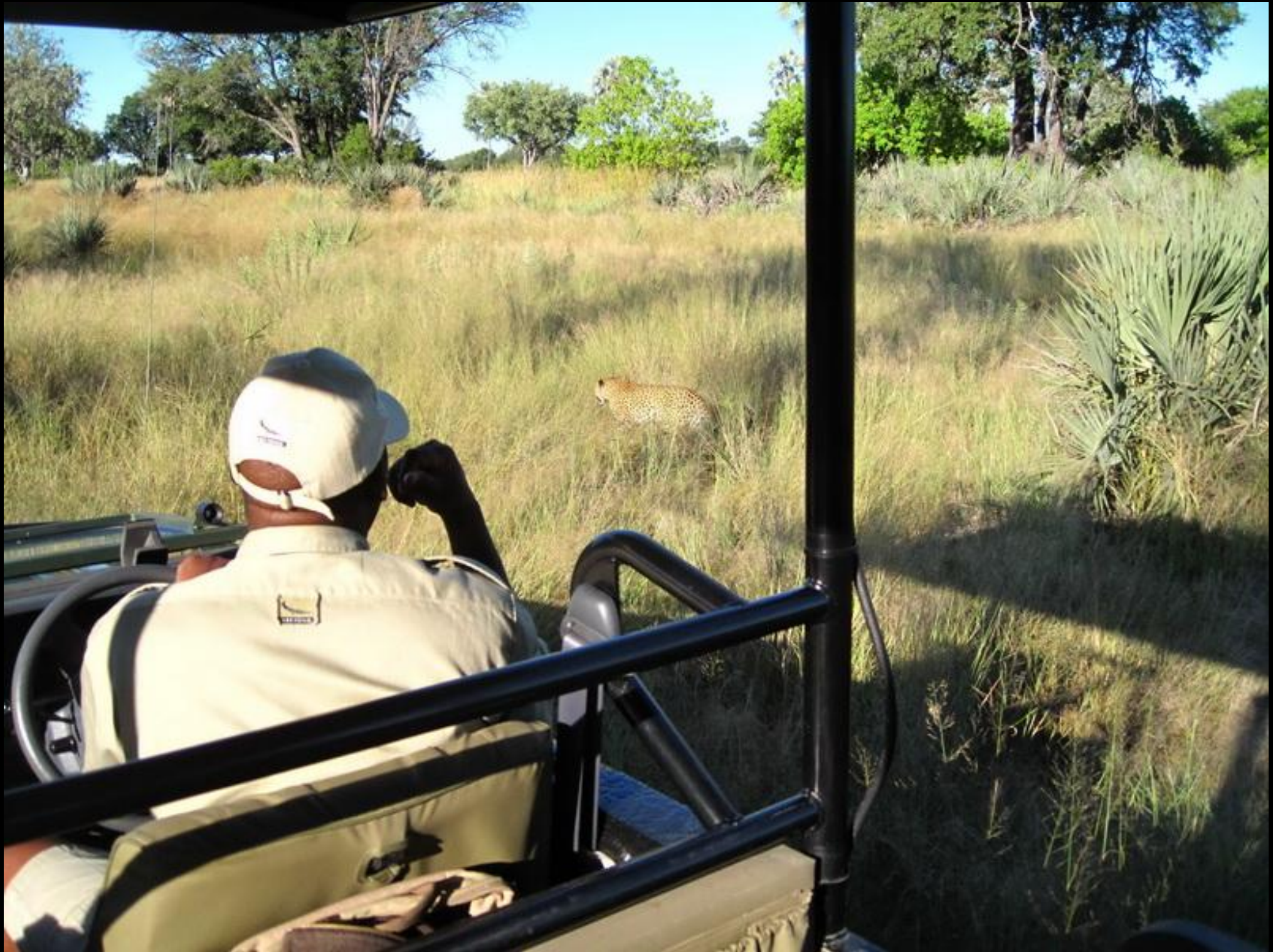
The guides would bring us so close to the animals. It was quite an adventurous experience.