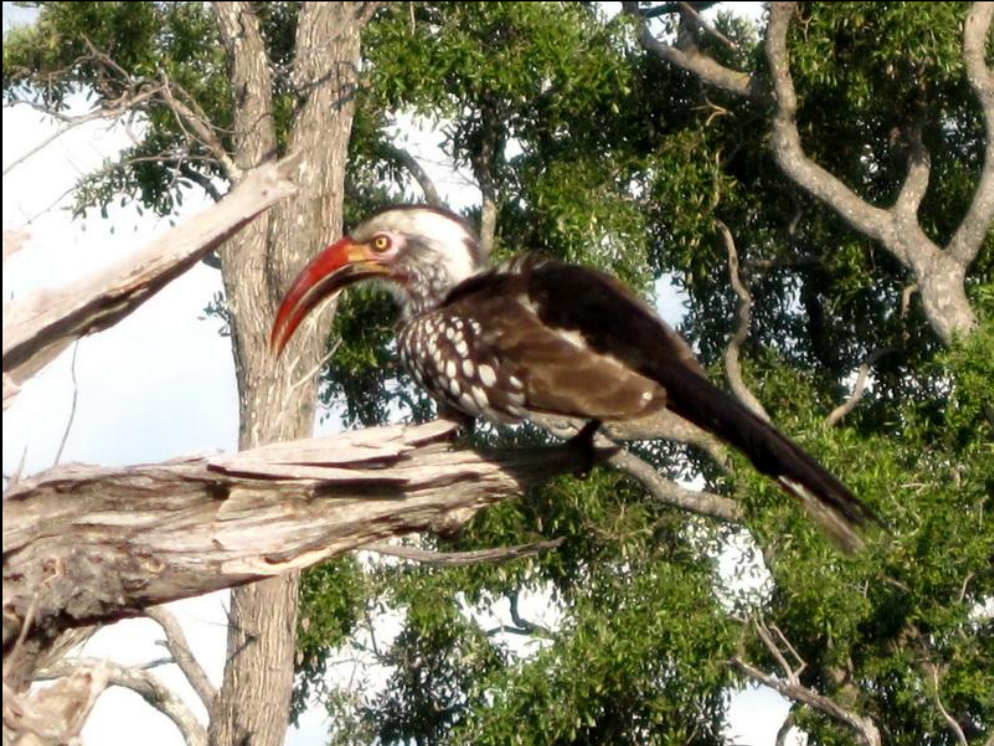
The red-billed hornbill is another very distinctive bird indigenous to this area.