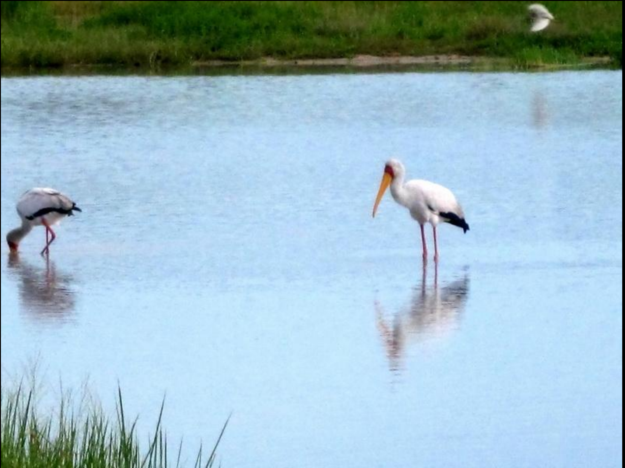
You would expect to see a yellow billed stork in a zoo, not in the wild like this.