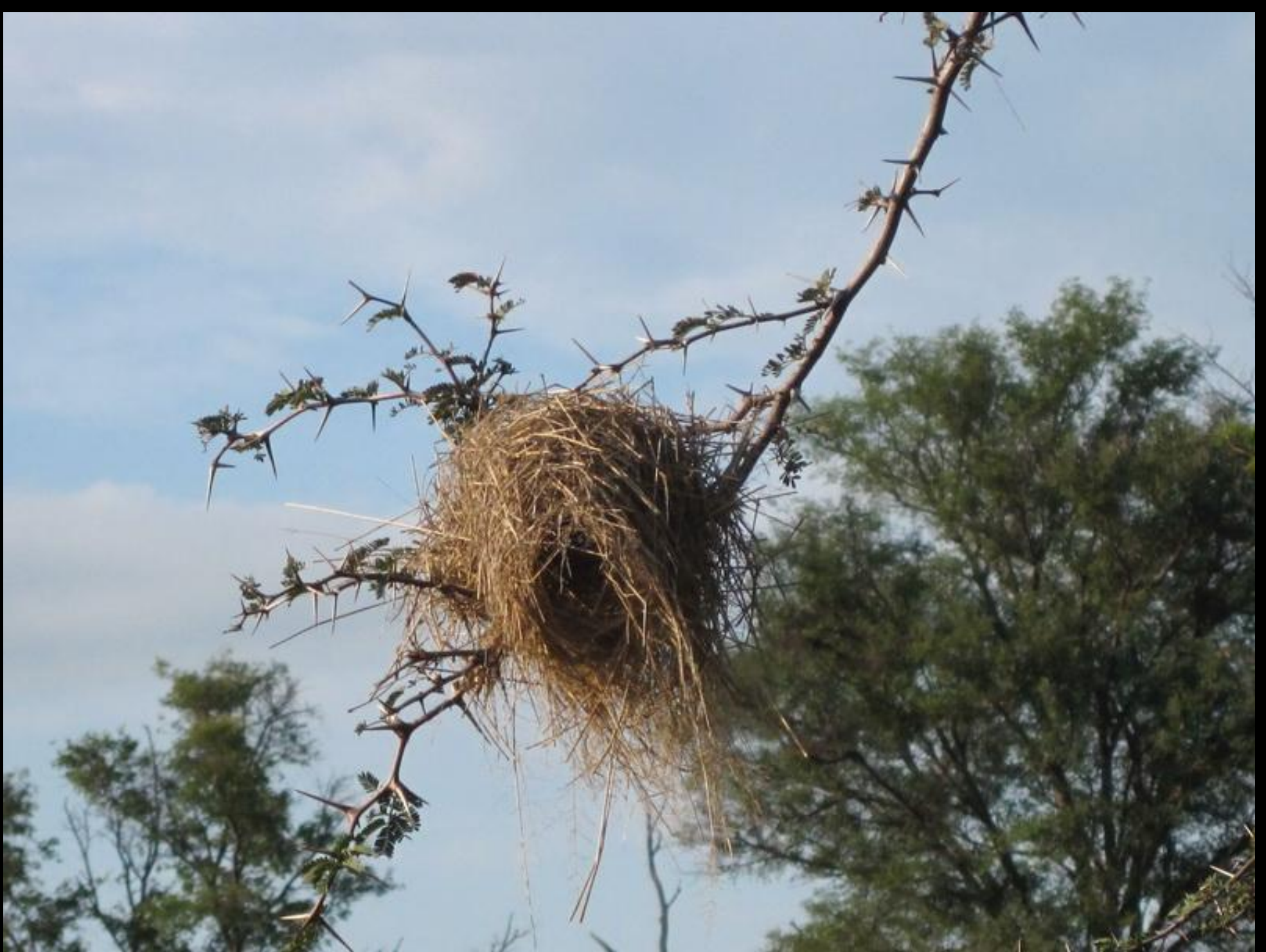
This very distinctive nest is made by the Weaver. They are small dark yellow birds which are voracious eaters of insects. Thankfully plenty of them come to roost on the boats in Douala, Cameroon eating many insects.