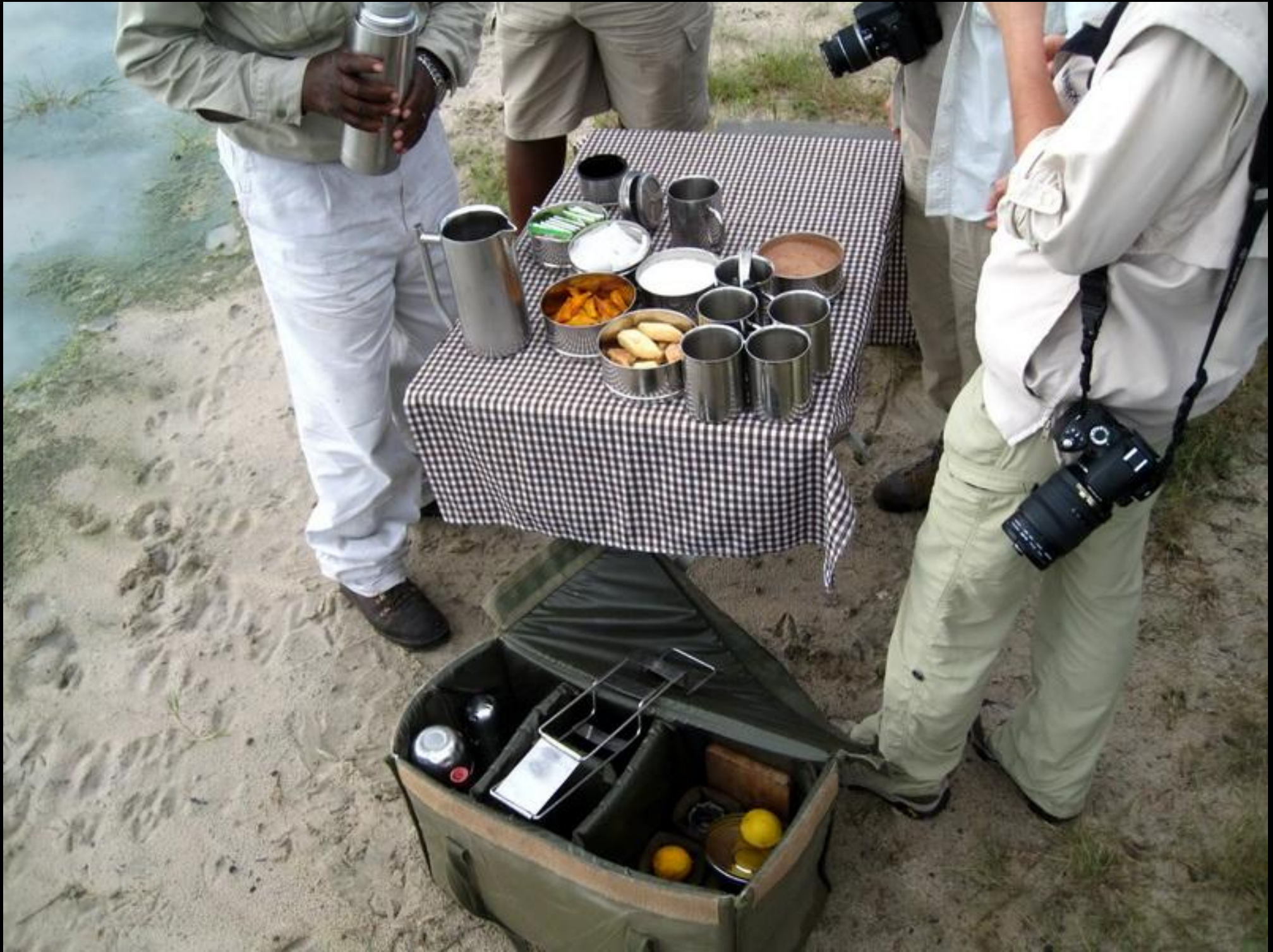
Here is another nice 0800 snack after our 0600 breakfast. You feel so pampered.