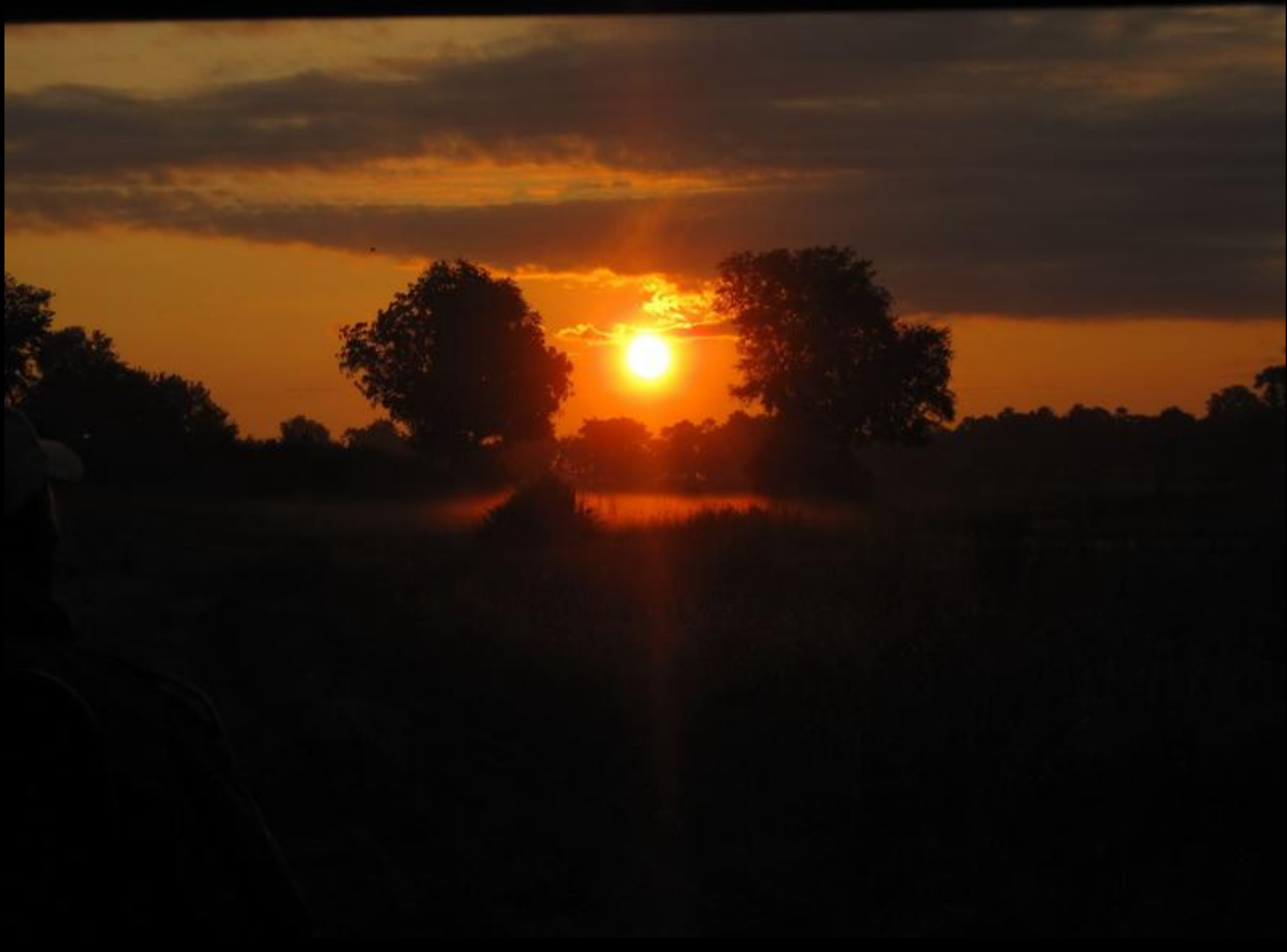
Yet another beautiful sunset in Africa