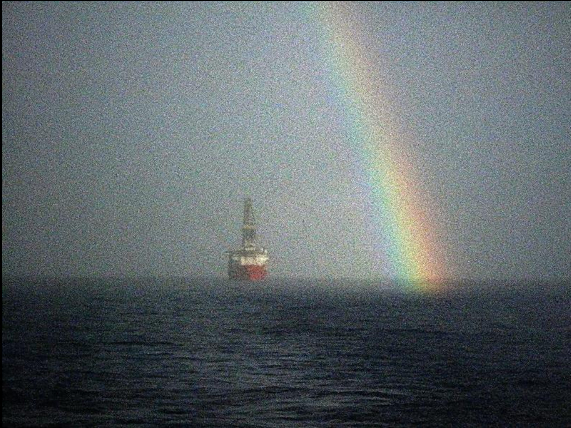
Belford Dolphin is under her own power moving to the next location. Yes, she did find the pot of gold at the end of the rainbow.