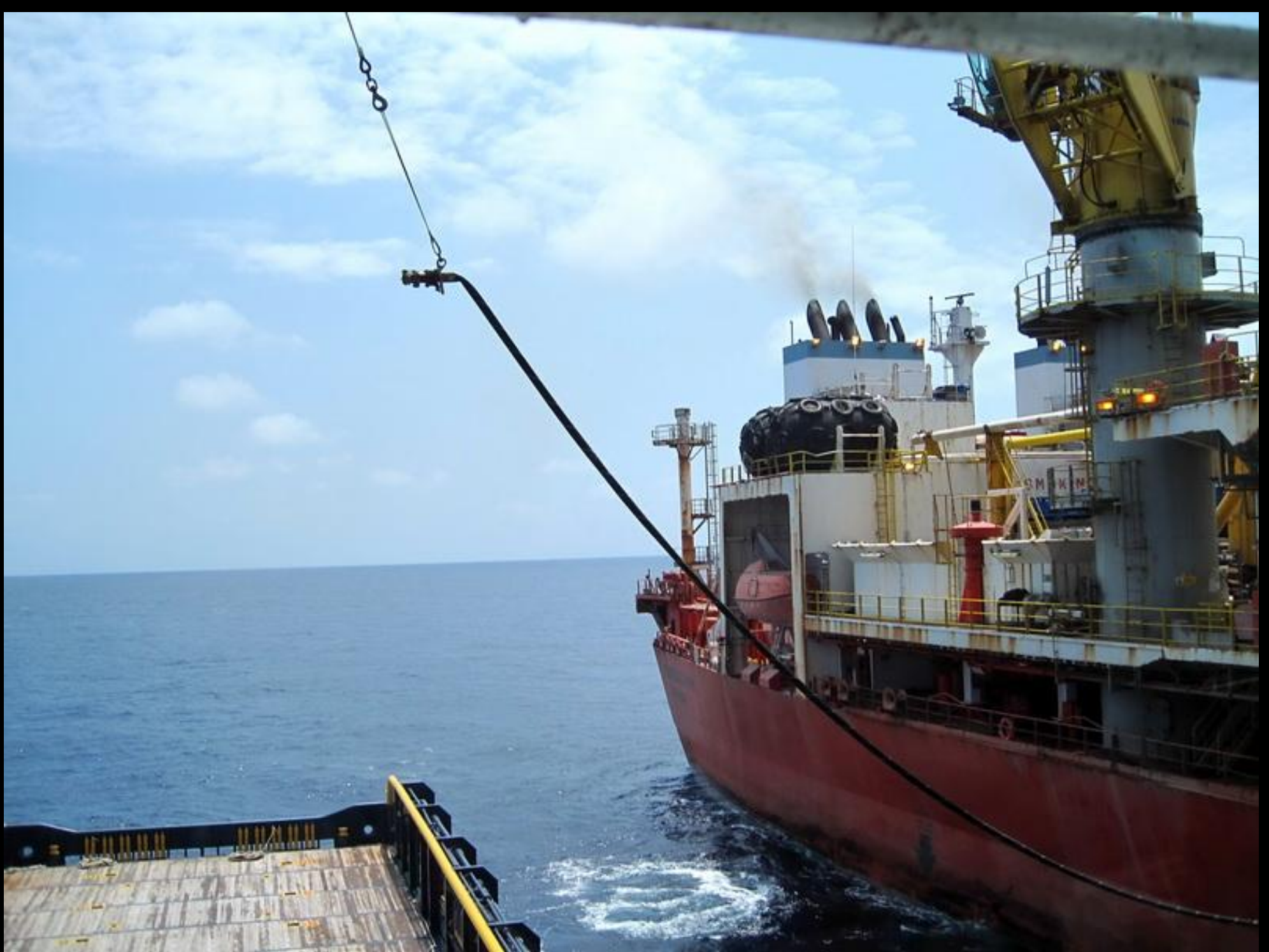
The Belford Dolphin had many modern technologies aboard. My favorite ones were the cargo hoses rolled up on reels and extra long booms on the crane. These very simple items made for a very safe and efficient operation.