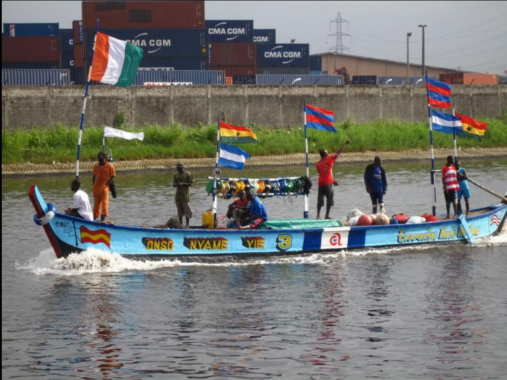
These fishing vessels would stay out for days offshore catching fish. It looks like a tough way to make a living.