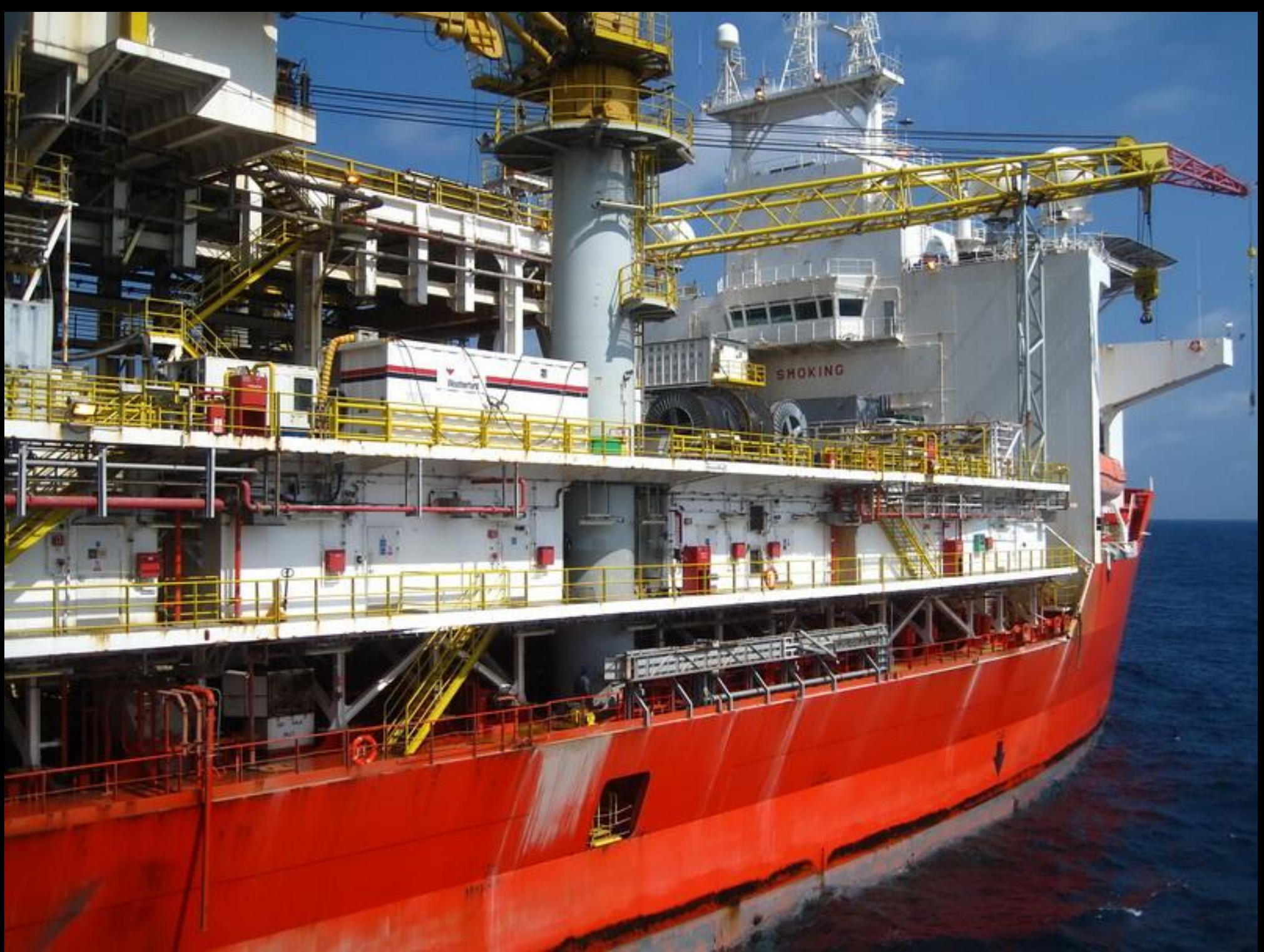
The orange and white drillship contrasted nicely with the blue Atlantic Ocean.