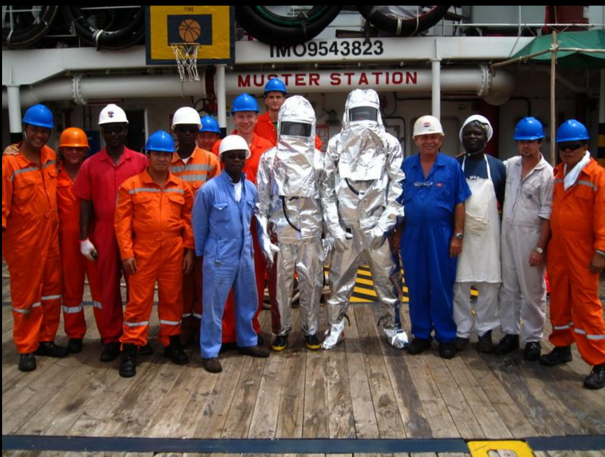
Fire drill on the Gubert Tide provides for a photo op. The Chinese fire suits looked a bit space age.