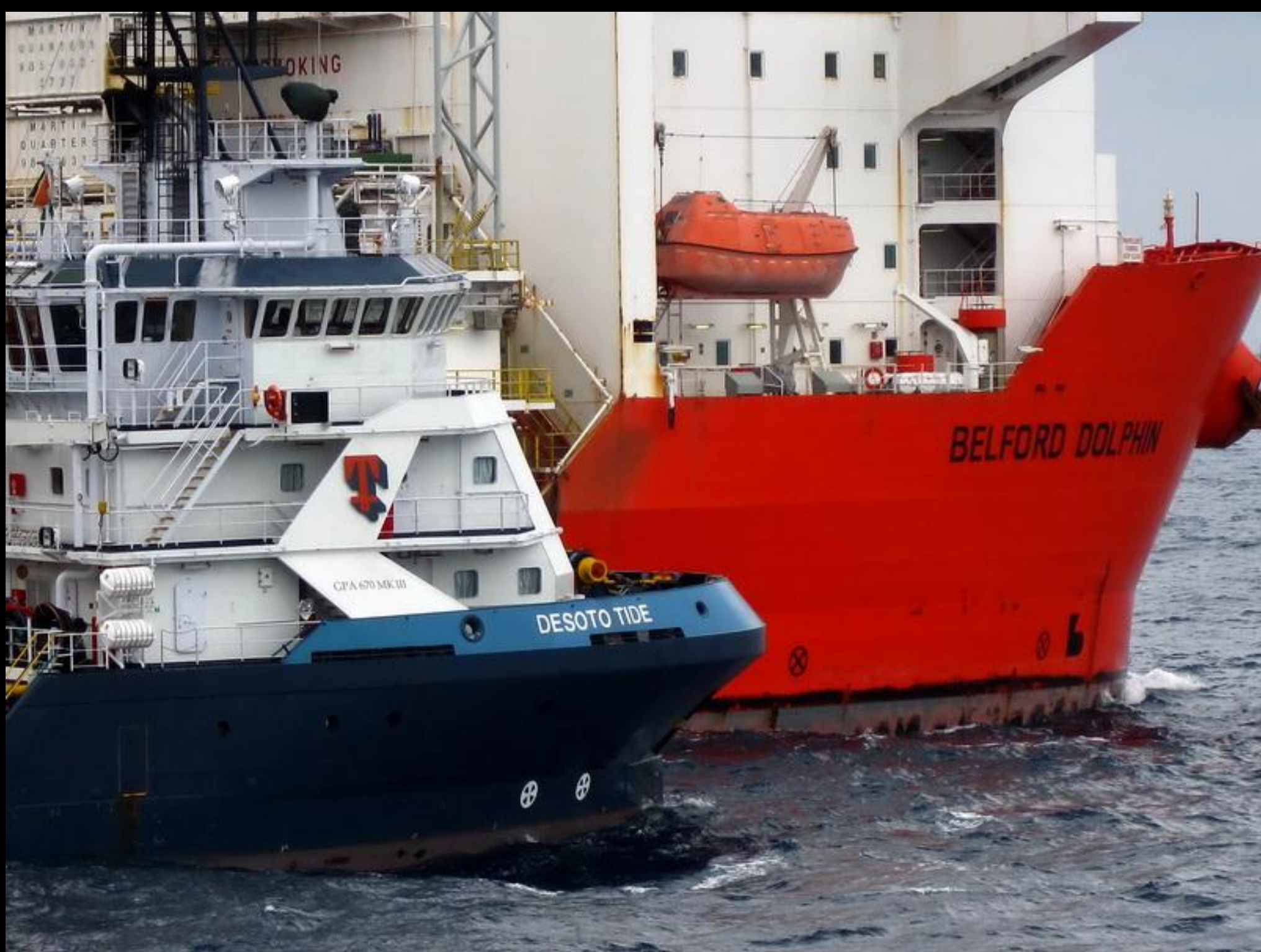
The Gubert Tide and Desoto Tide were excellent workboats and my favorite of the Tidewater fleet so far.