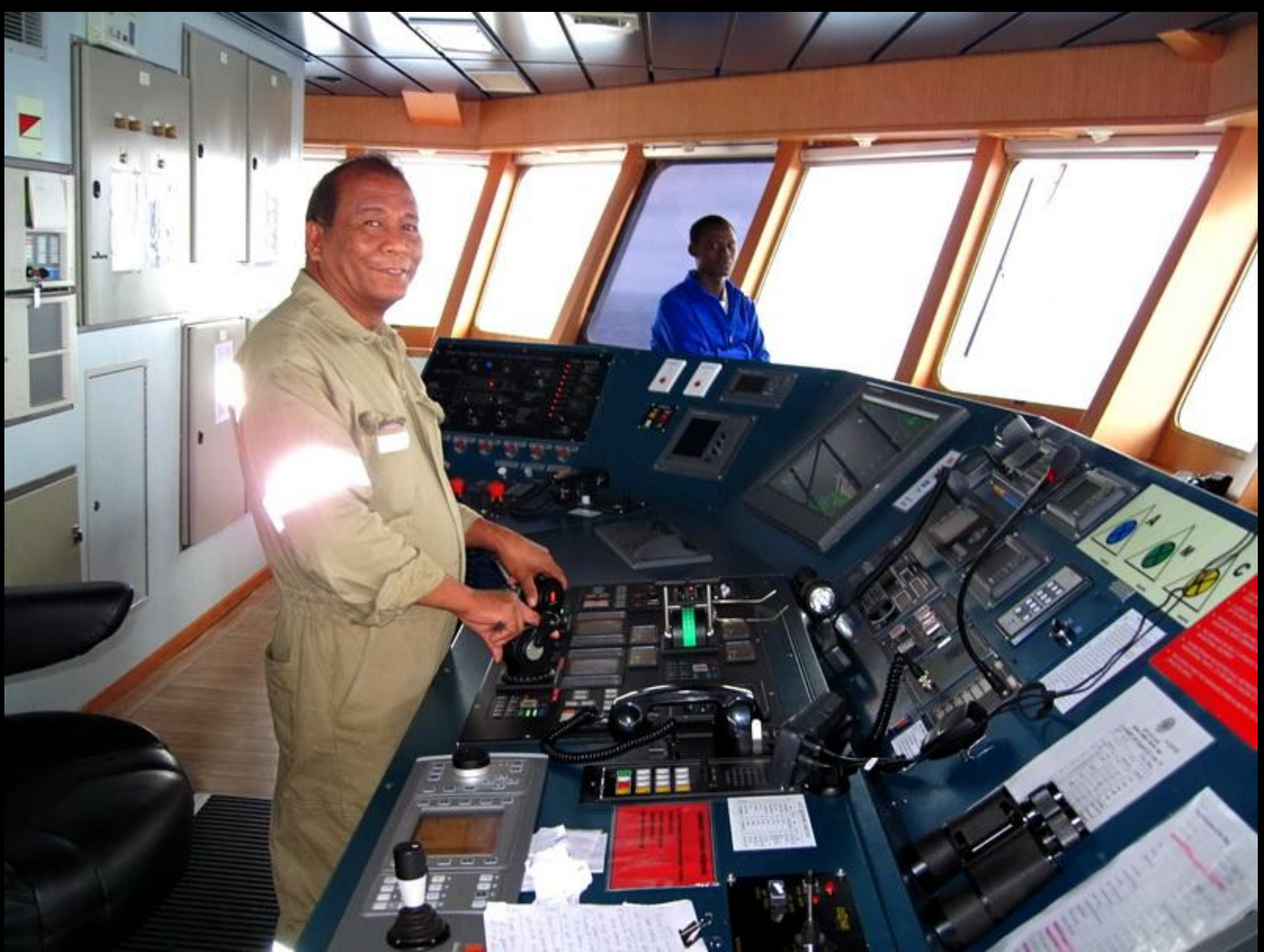
Teaching mates to run the diesel electrical Z-drives and DP-2 systems is very rewarding (for both parties).