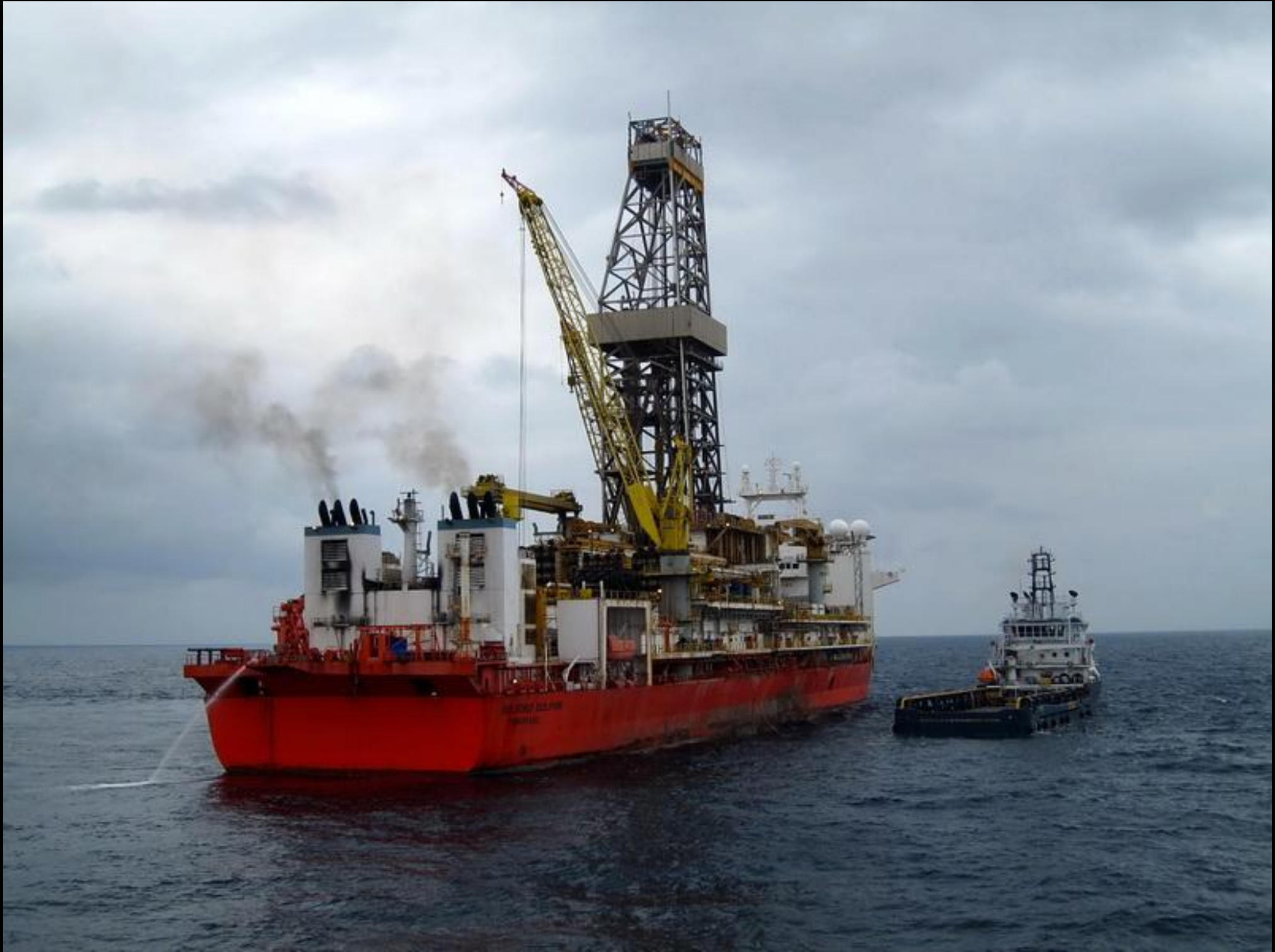
The Desoto Tide working alongside the Belford Dolphin shows how the Gubert Tide looked working alongside the drillship.