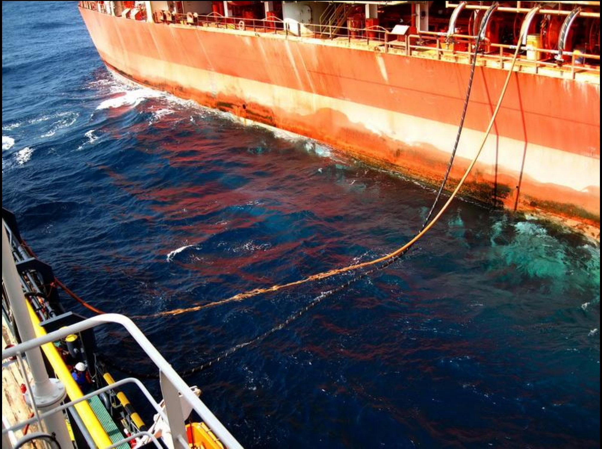
We are simultaneously pumping fuel through one hose and water through the other.