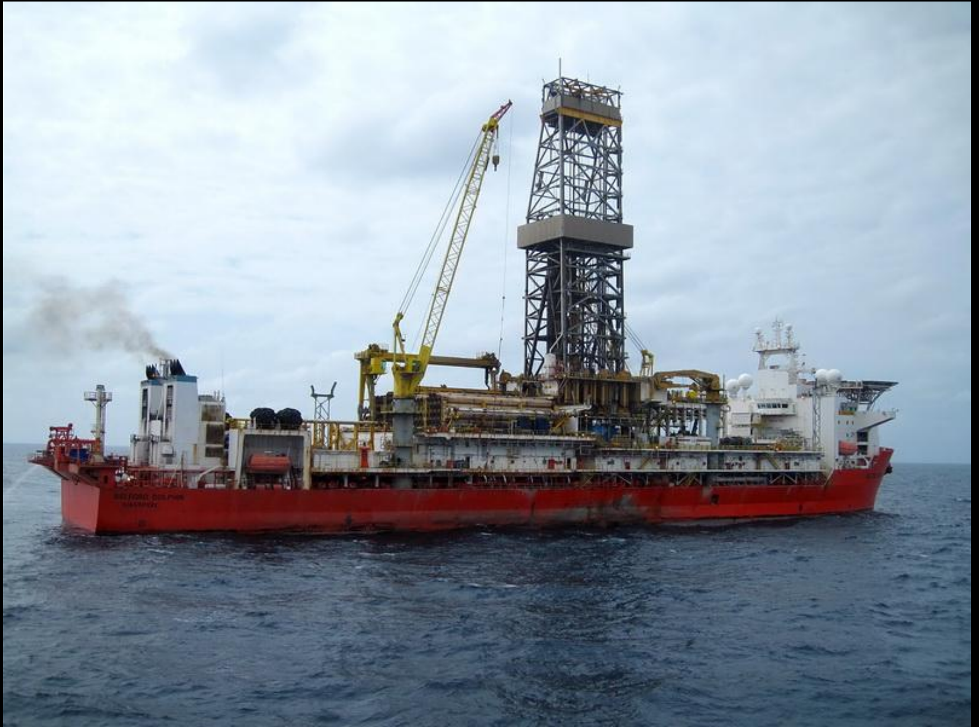
The Belford Dolphin Drillship was engaged by Anadarko to drill its deep water prospect Venus B-1 off the coast of Sierra Leone. The country was not politically stable so the base of operations was Abidjan, Côte D'Ivoire, a three day voyage. This made logistics very challenging but all worked well.