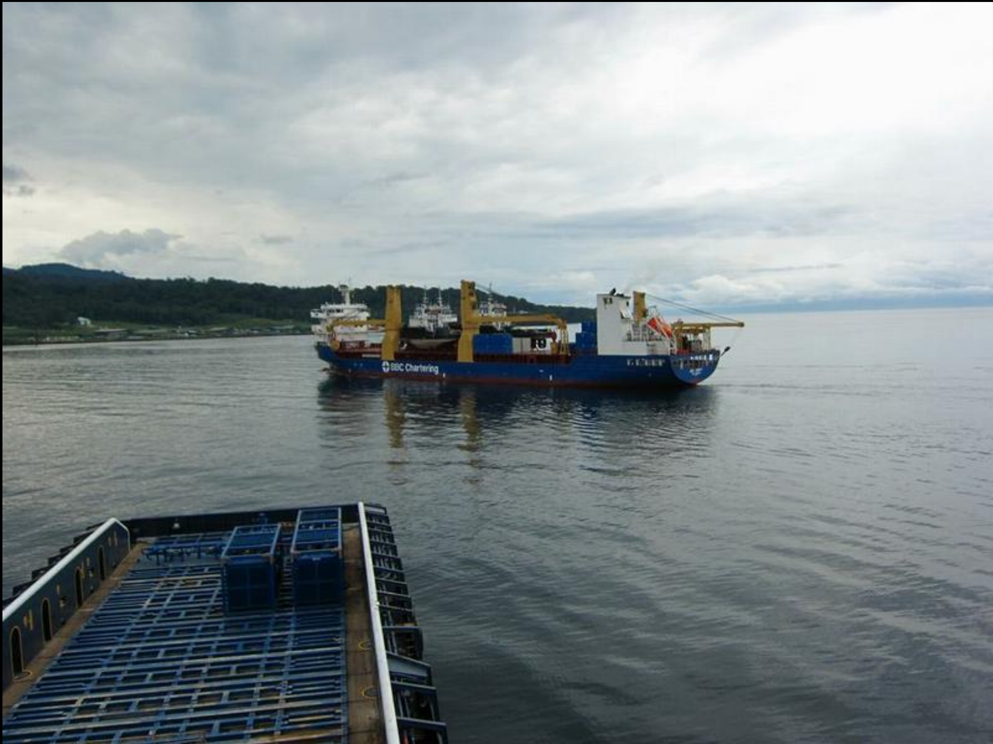
The cargo ship is headed into the dock.