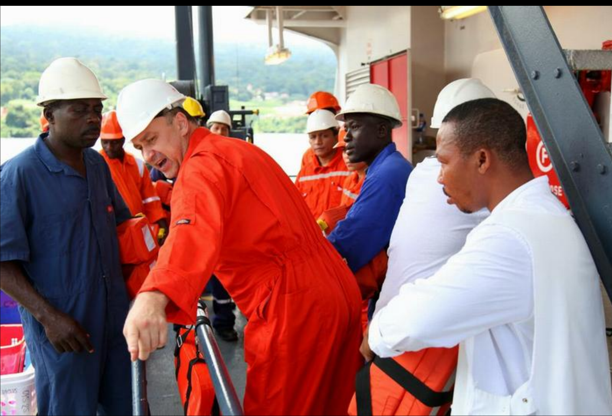
Our drills are very animated as you can see.