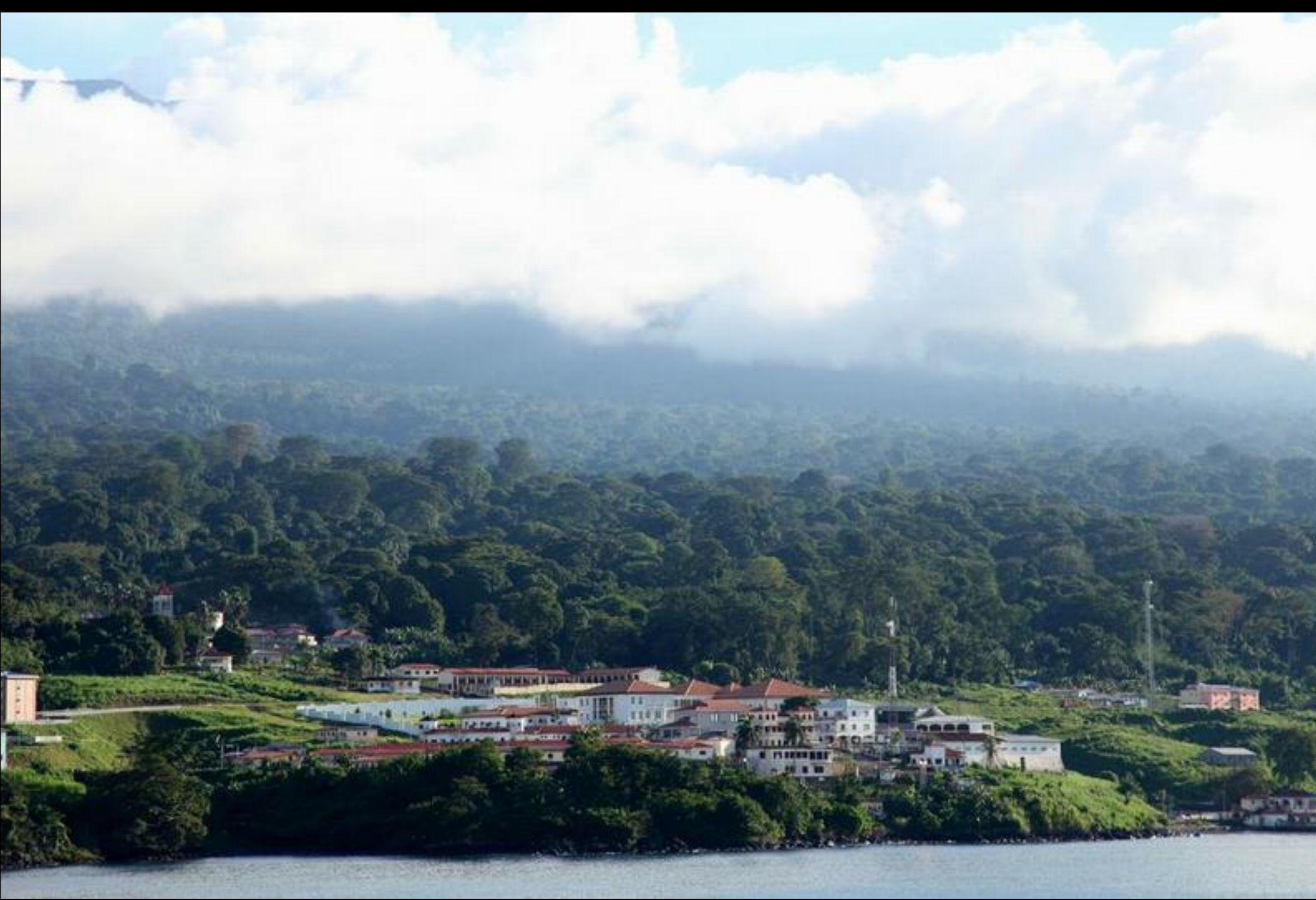
The main part of the town comes right down to Luba Bay.