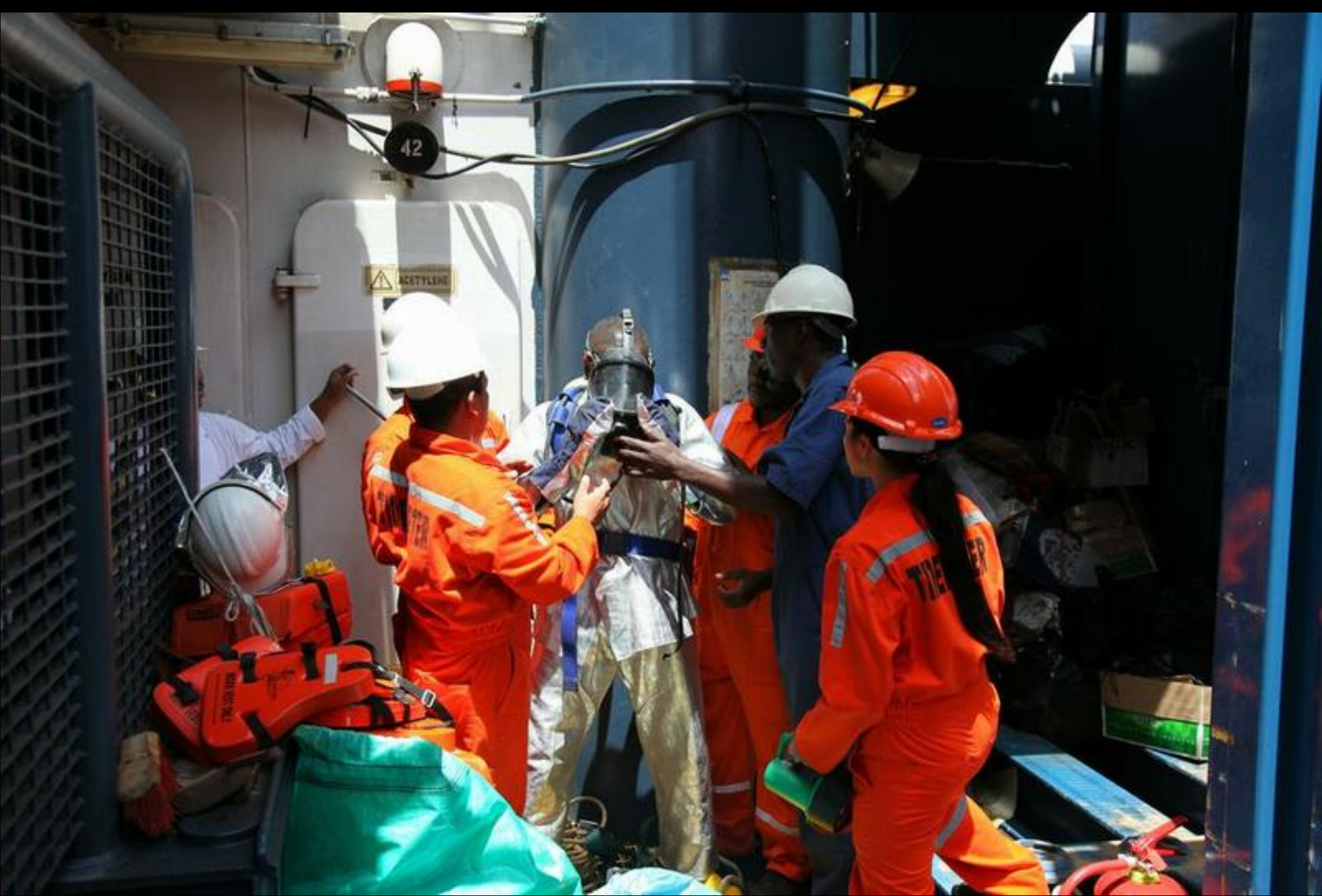
One of our AB's is being suited up to fight a fire for one of our drills.