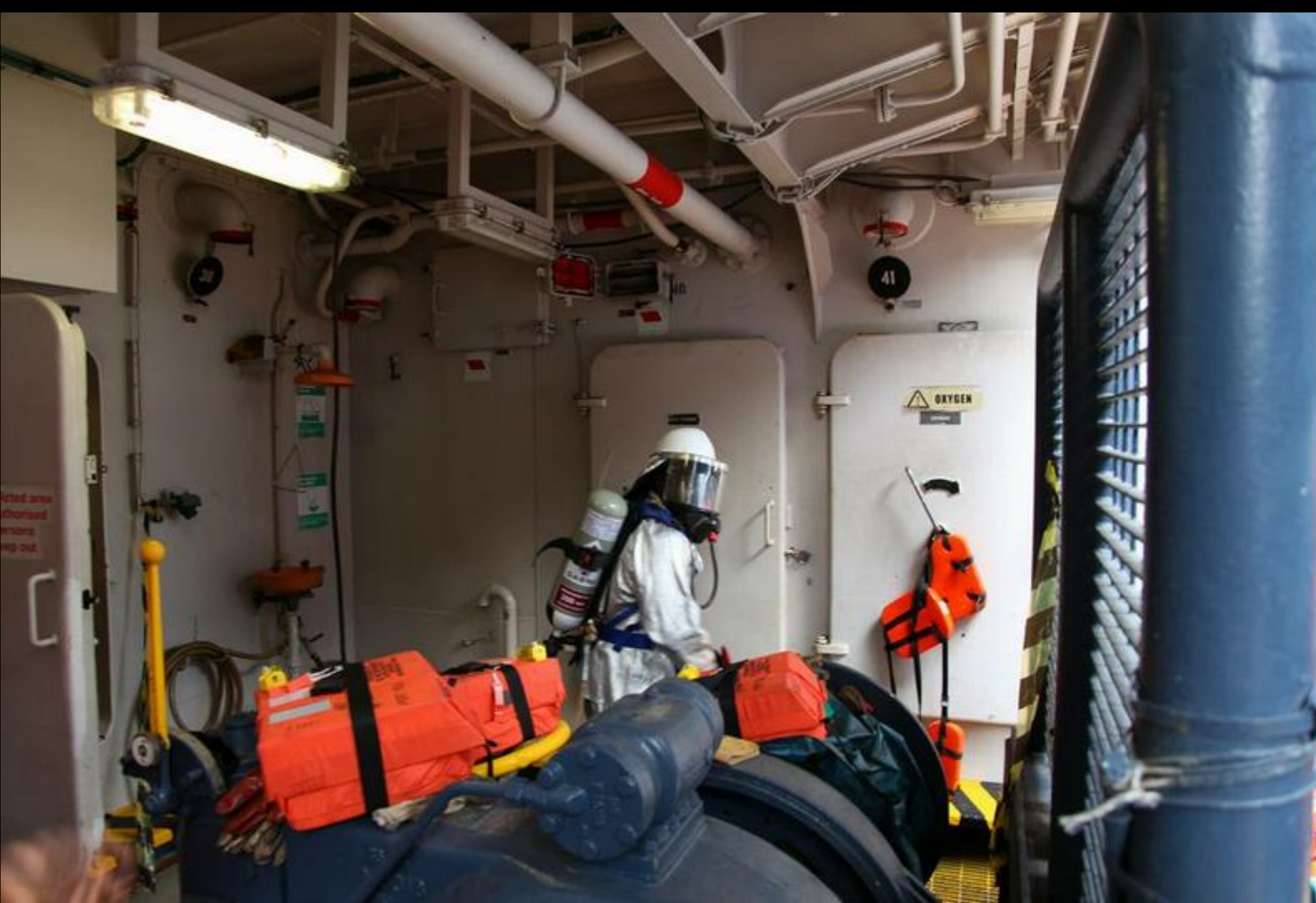
He simulates fighting the fire complete with SCBA bottle on his back.