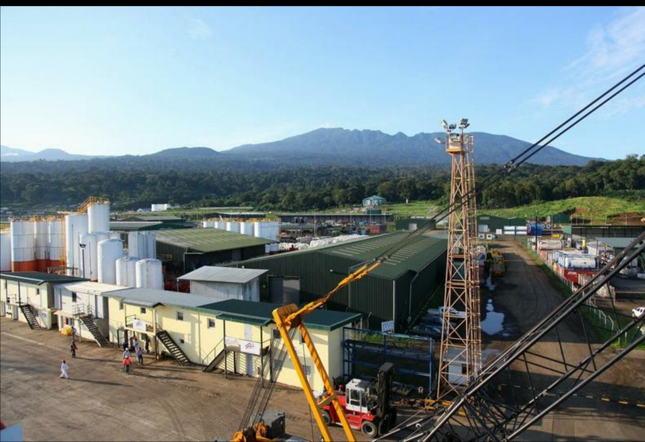
A look at Luba Freeport from the bridge of the Art Carlson - Hess, an oil company, occupies many of the green buildings.