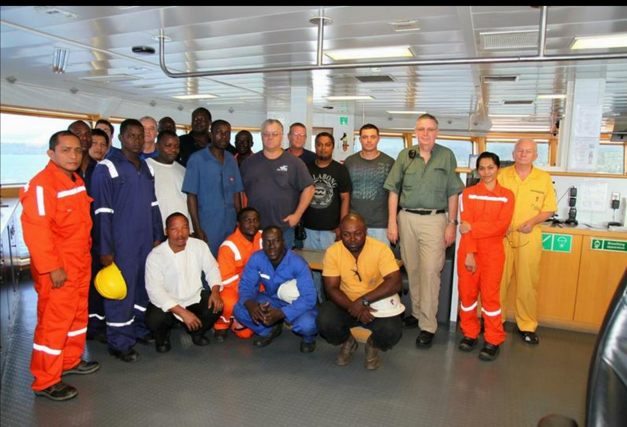
The participants of our weekly drill, including personnel from Baker Hughes, pose for a photo.