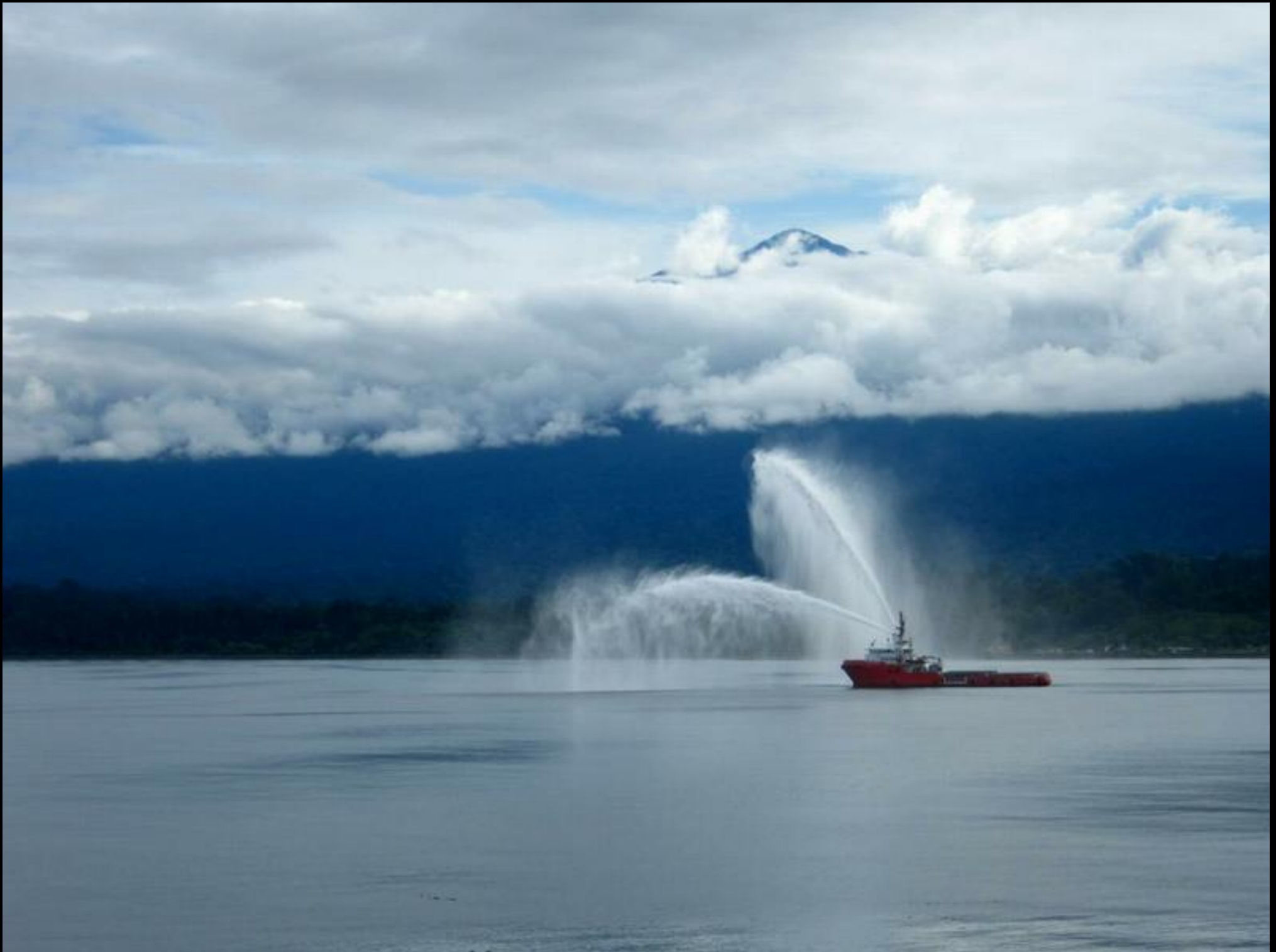
A vessel is testing its FiFi system with the mountain as a backdrop.