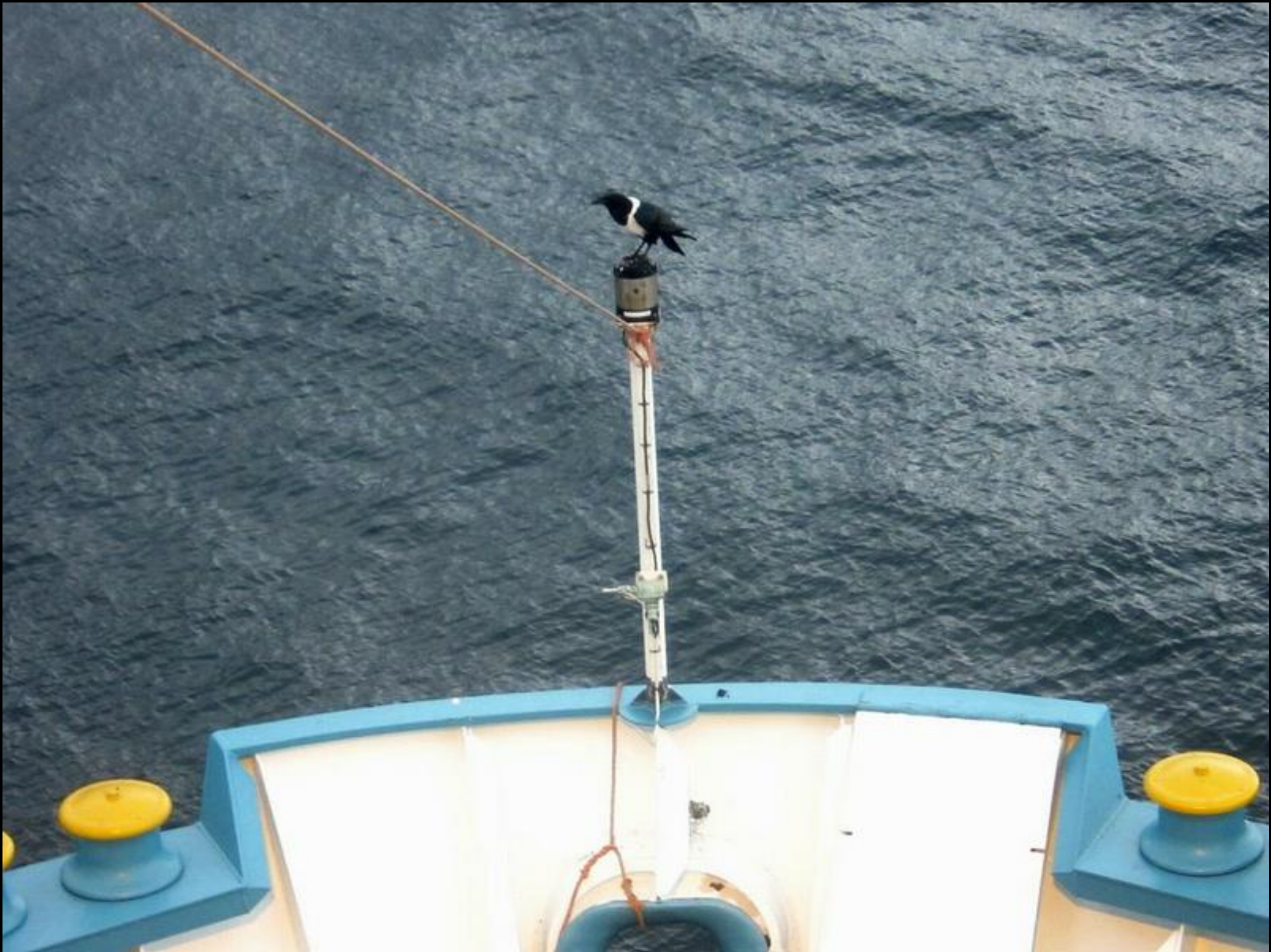
A visitor while we were at the anchorage. It's very distinct coloring should make it easy to look up when I return.