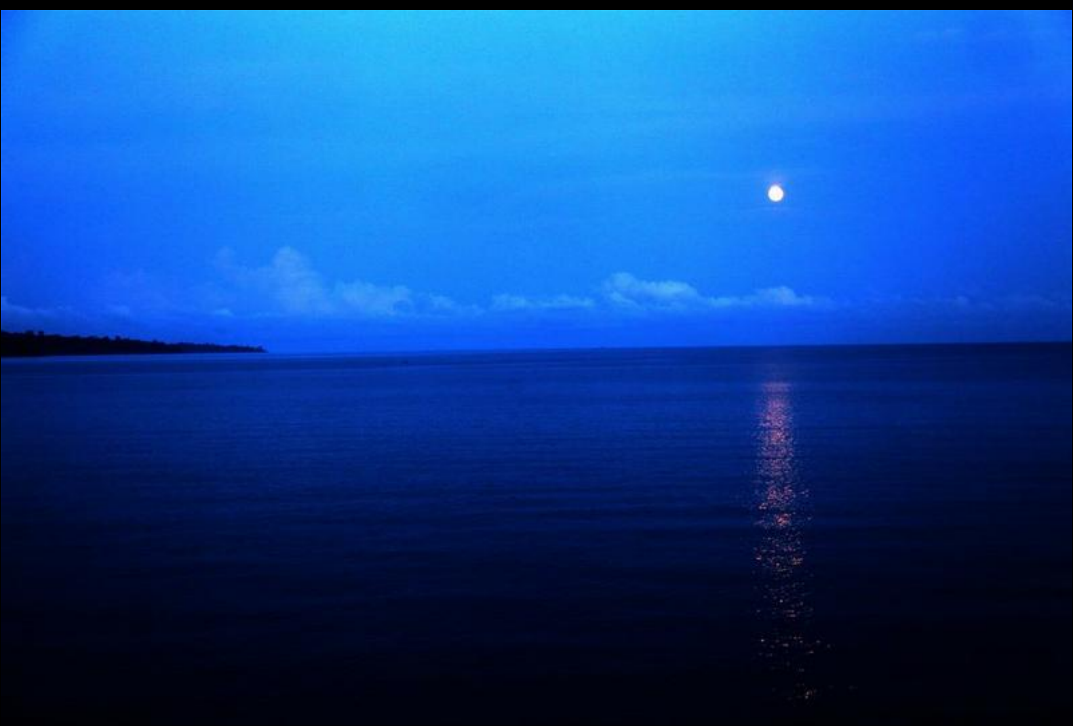
Shot from my stateroom at dawn, the moon is ready to set over the western horizon.