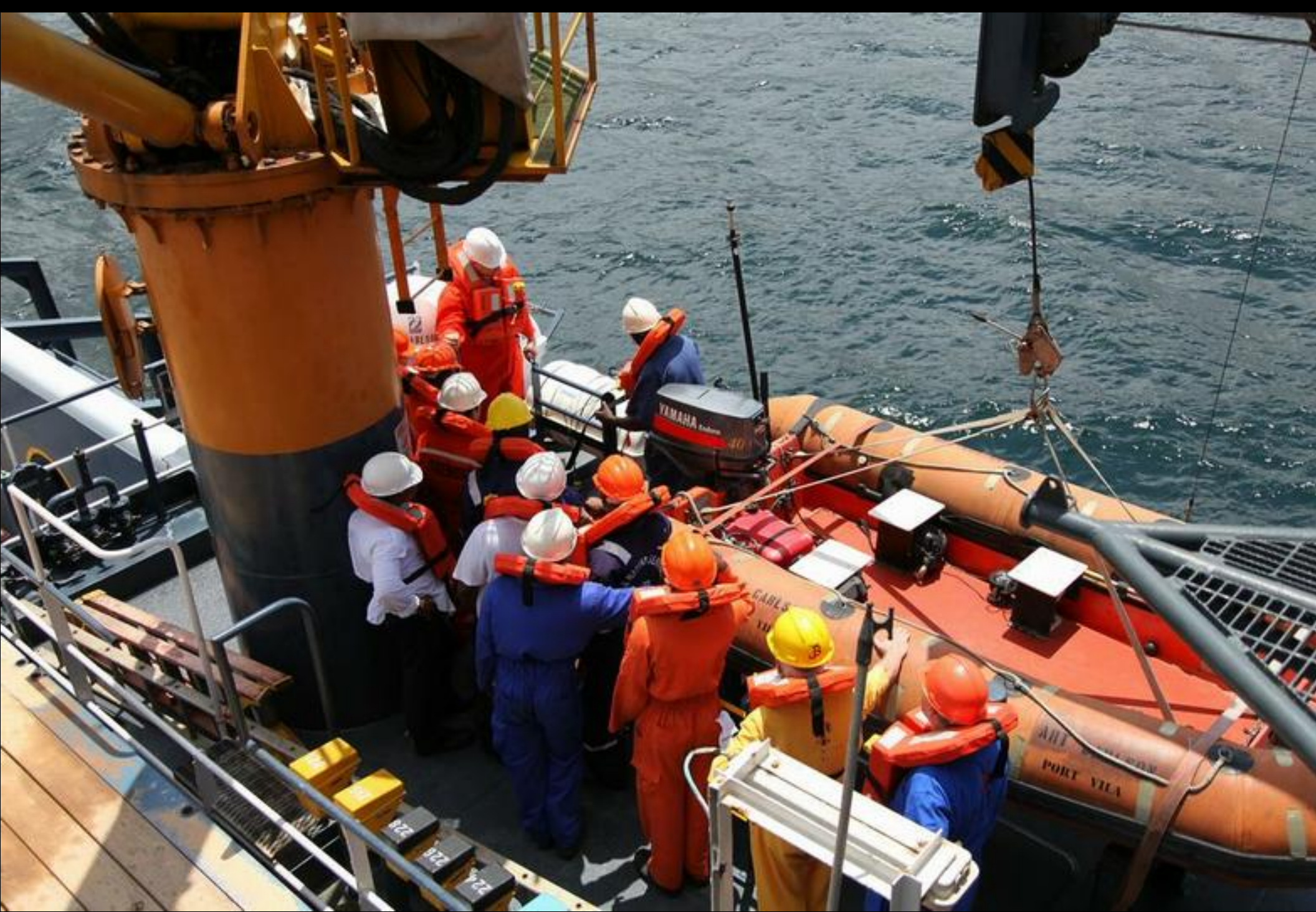
Everyone has their turn at explaining how the life raft is launched and operated.