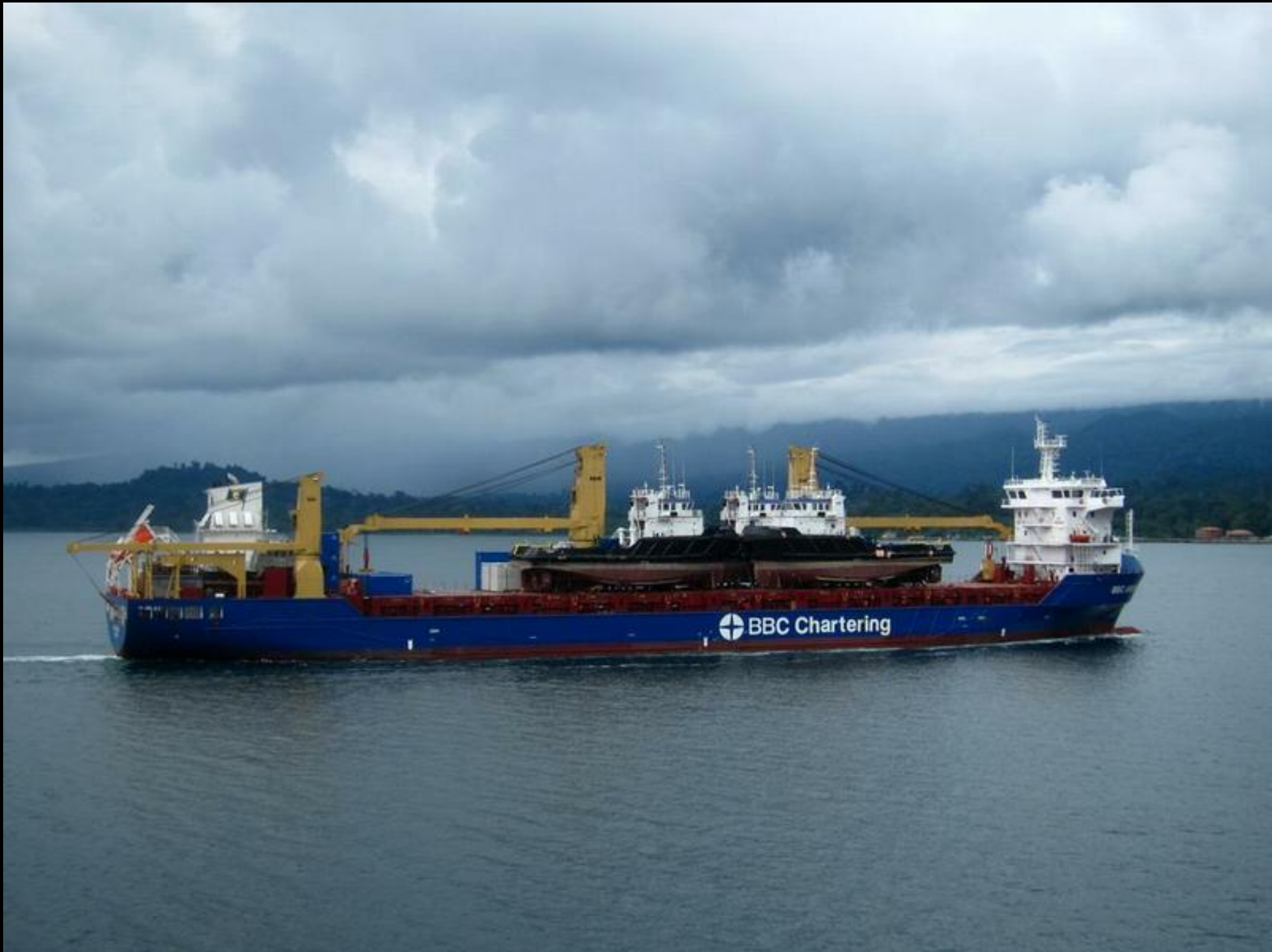
Cargo ship arriving in the anchorage awaits its turn for the dock in Luba.