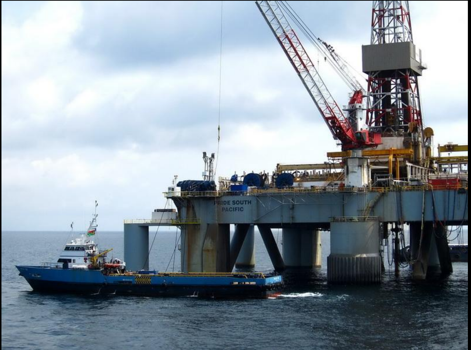
The Maslenny Tide, a Fast Supply Vessel, is an oversized crew boat at 175 feet in length. She has dynamic positioning computers. She has four propellers at the stern and a drop down Z-drive bow thruster.